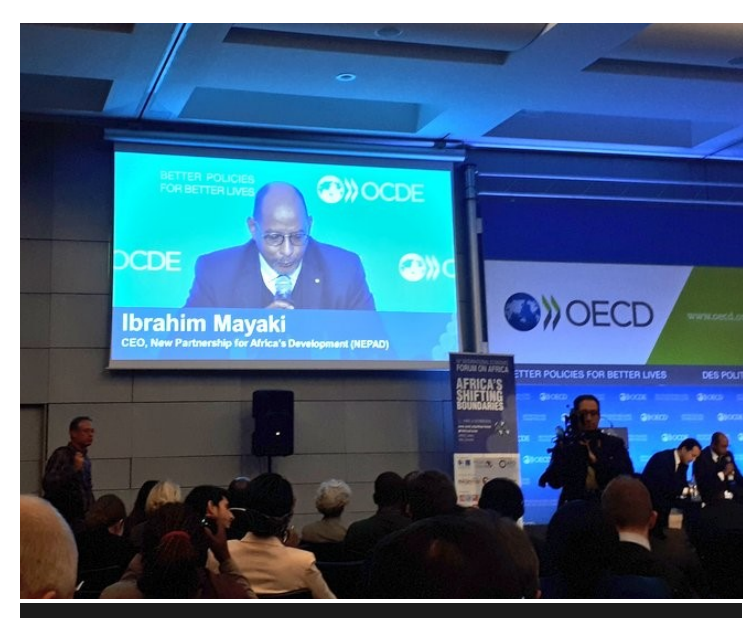
Dr Ibrahim Mayaki at the 18th International Economic Forum on Africa, "Optimal solutions for national challenges are found at a regional level"