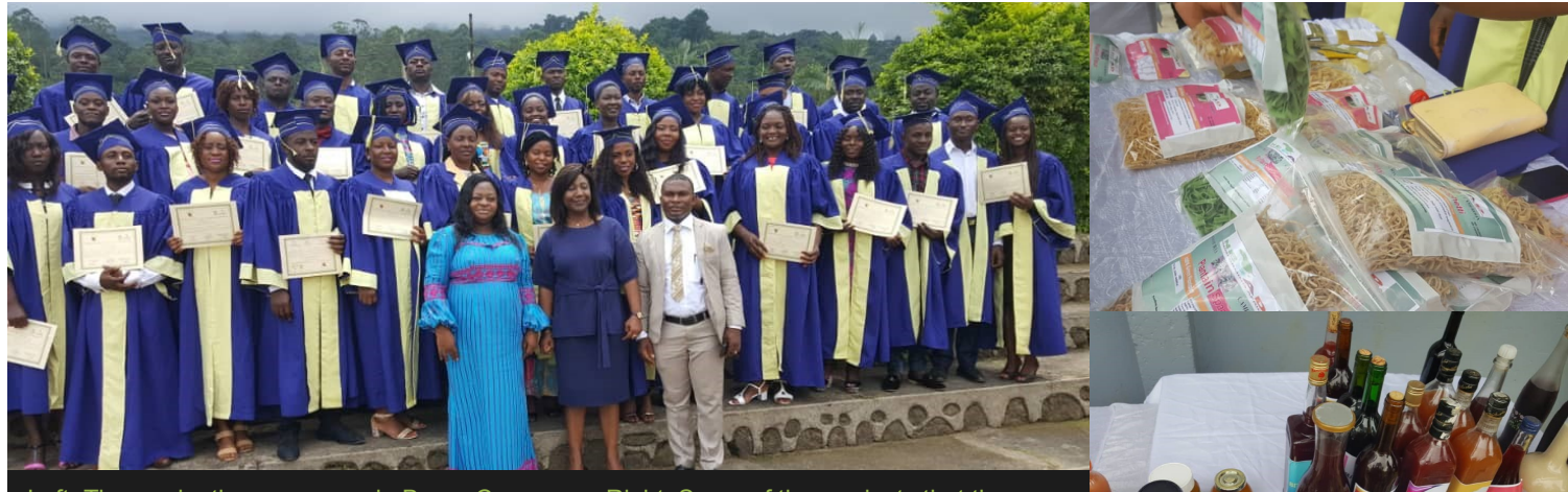
Left: The graduation ceremony in Buea, Cameroon. Right: Some of the products that the trained youths produce