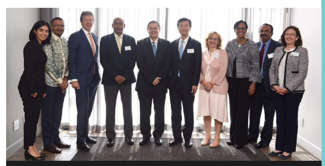
Keynote panellists at the G20 and Africa - Navigating African Priorities for the G20 conference in Pretoria

Representatives from the T20 African Standing Group met to enable more active participation of Africa in key global political, economic and developmental processes