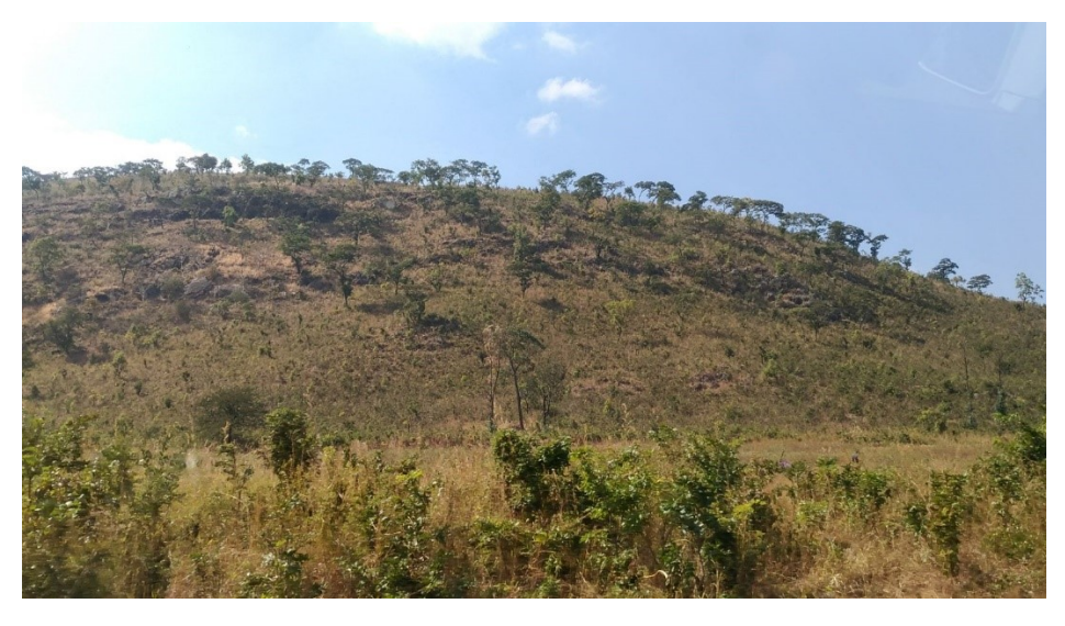
Assisted natural regeneration in Kapirimutu, one of the seven hills in Dedza, Malawi, adopted by the community

Lilongwe, July 19, 2017 — The Government of Malawi collaborated with the NEPAD Agency in organising the TerrAfrica Partners' Joint Mission in the country from 17-19 July. The objective of the TerrAfrica joint mission was to take stock of and get a full understanding of the ongoing work and status of Sustainable Land Management in Malawi. It was also to see how best to coordinate TerrAfrica partners' efforts to provide comprehensive support for the implementation of identified Sustainable Land and Water Management (SLWM) priorities in Malawi.