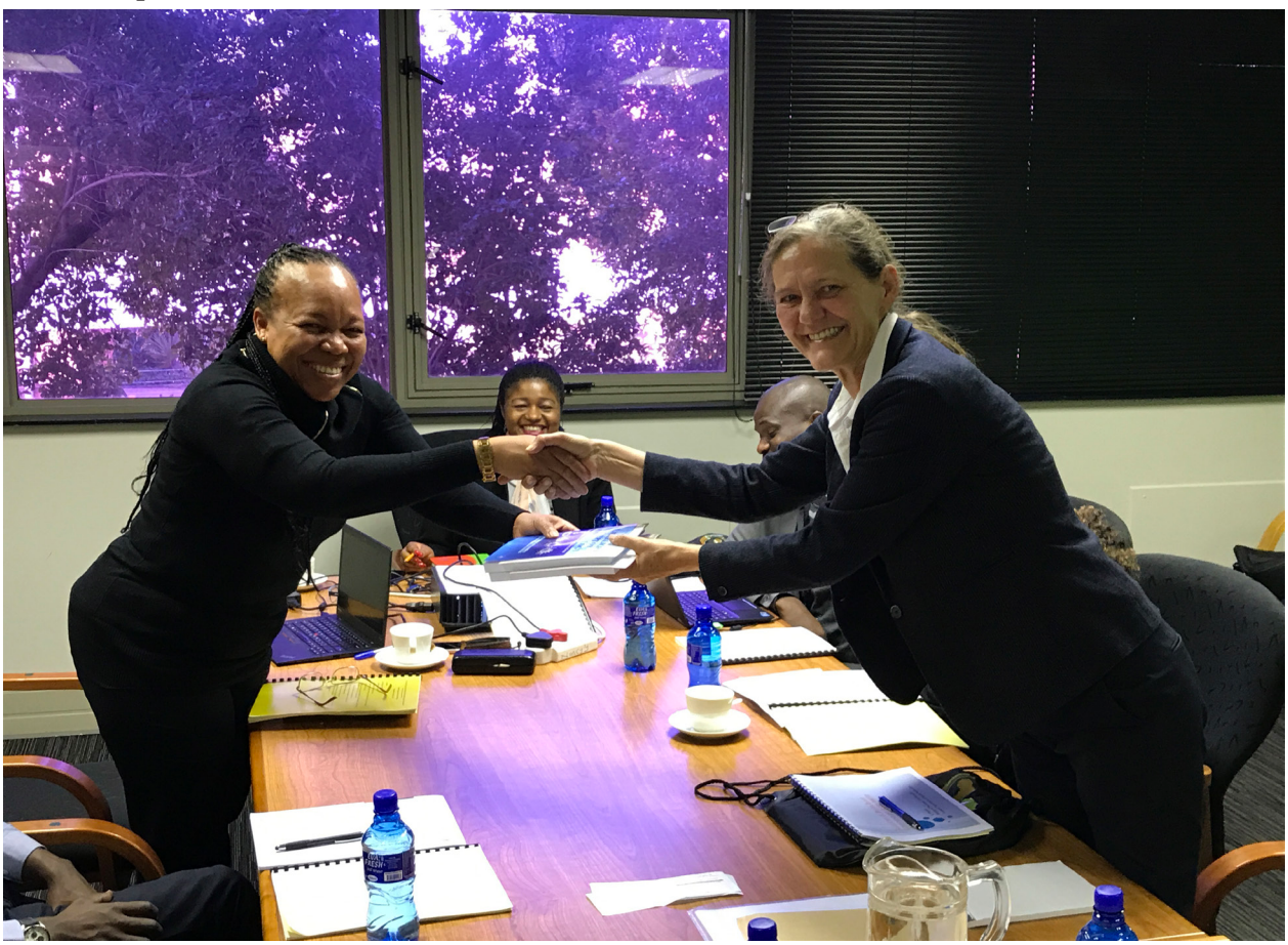
NEPAD and PEI team exchange knowledge materials during the meeting in Johannesburg, South Africa

In addition, PEI will leverage the AMRH Regional Centres of Regulatory Excellence (RCOREs) to establish a forum for regulators of blood in Africa to encourage networking. This forum is expected to contribute to the role of the AMRH programme as a continental technical expert group and will facilitate the implementation of e-Health-structures for data-driven regulation of blood and blood products. NMRAs in Africa can submit applications for consideration of pilot projects on blood regulatory systems by responding to the following link; http://www.nepad.org/sites/default/files/GHP%20call%20for%20proposals.pdf