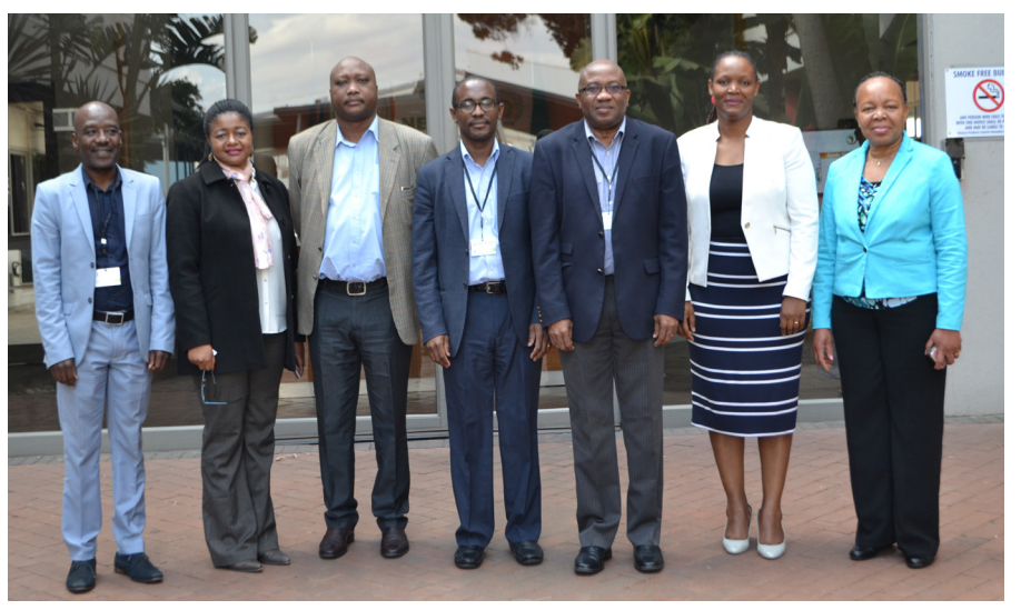
EDCTP, NEPAD and BMGF team that attended the meeting in Johannesburg

Furthermore, the earmarked Cooperation Agreement will be useful not only in enhancing partnership but also in harmonizing similar work of the two organizations to ensure alignment with the African Medicines Regulatory Harmonization (AMRH) initiative.