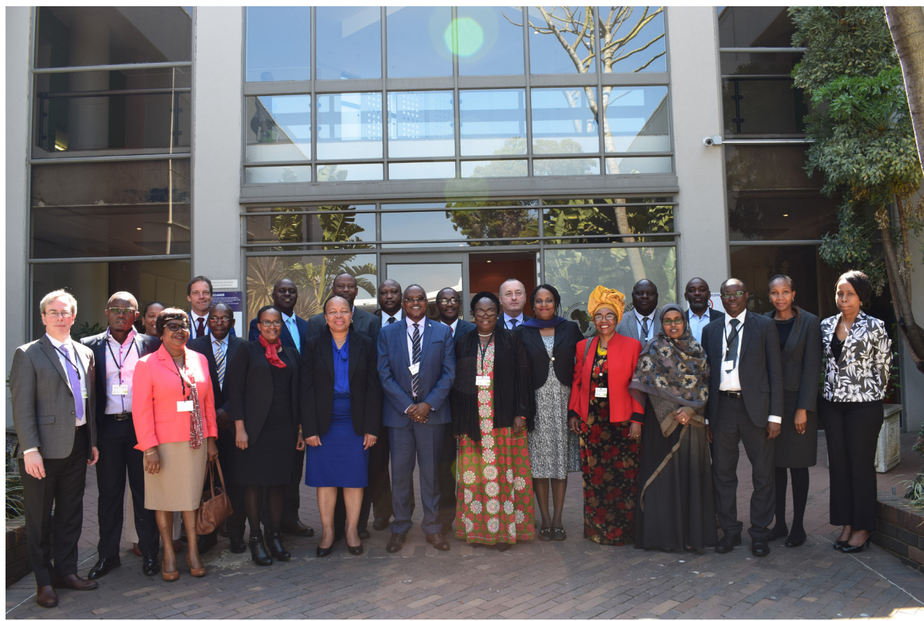
Representatives from different organizations that attended the Steering Committee meeting in September 2017