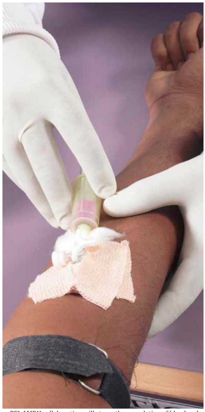
PEI-AMRH collaboration will strengthen regulation of blood and blood products in Africa

The regulation of blood and blood products stream of work in Africa will be guided by the WHO Global Benchmarking Tool/BRN Criteria in accordance with the recommendation of the World Health Assembly (WHA) 63.12, 2010 resolution on the availability, quality and safety of blood products. The GHP at PEI focuses on two modules that align with the WHO Criteria and WHA recommendations on the regulation of blood and blood products and these include;