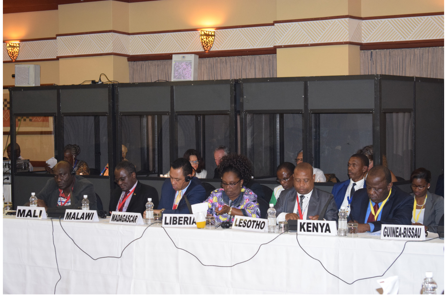
African Ministers of Health during the AMA side meeting in Victoria Falls, Zimbabwe

The AMA Joint Secretariat comprised of WHO, AUC and NEPAD Agency is planning to hold another Ministers of Health consultation in Kampala, Uganda in October at the upcoming 4th Global Health Security Agenda High Level Meeting.