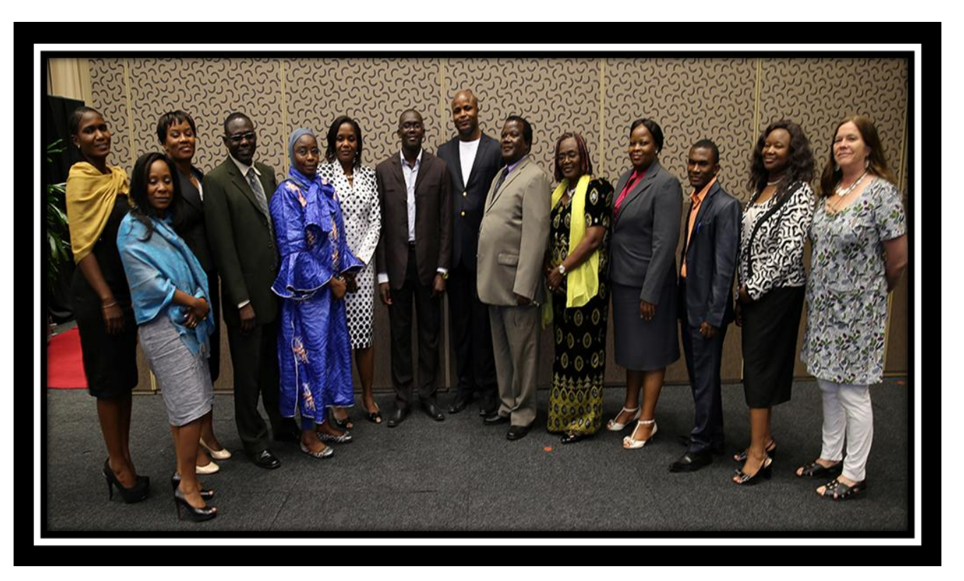
Organized by the NEPAD Planning and Coordinating Durban, Republic of South Africa, 6-07 October 2014

REC Consultation Programming Workshop on the Gender, Climate Change and Agriculture Support Program (GCCASP)